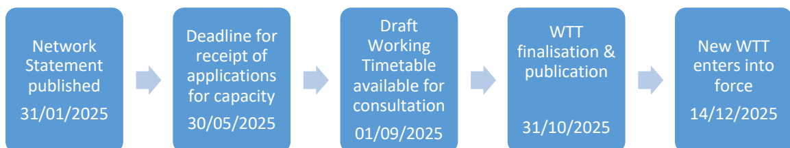
Figure 1 – Allocation Timescales

The timescales for development of the working timetable and allocation of specific train paths (national and international) are shown in Figure 1 below.