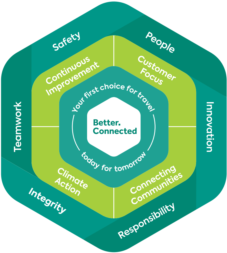
The Translink Spirit

This will mark significant milestones in Translink’s Future Ticketing System roll-out, transforming public transport to future-proof services for full network ticket integration and to support passenger growth.